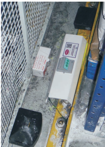
At each location, Acheta installed a GTO detector and a variety of 'bait stations' using non-toxic bait & traps