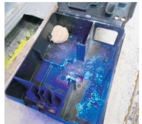
Only one of the plastic bait stations was entered and there was no bait take