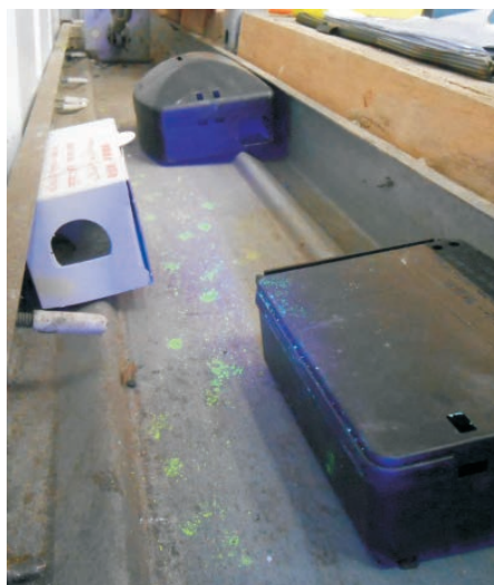
Evidence from the tracking dust that mice are avoiding all types of bait station