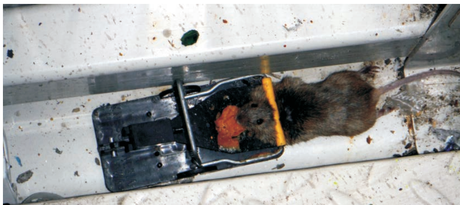
A break-back trap, peanut butter and no housing worked, but would it be allowed?

John takes up the story: “On the bait under the GTO guttering we found one full and one part take. In the plastic bait stations, we had no takes and evidence for mouse entry (UV footprints) in only one station. The cardboard bait stations didn't do much better. We had one part take and evidence